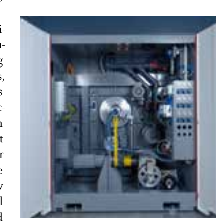
Cleared up components and free access for maintenance work: Moving the exhaust unit creates space and cleanliness.