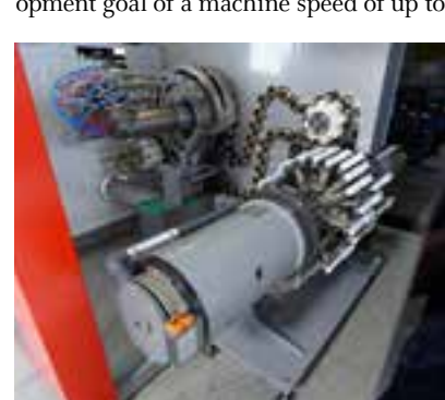
Two or three rows in the internal coating dryer in future: The newly developed, dirtresistant equalization distribution drum permits new dryer combinations.

The technical features and innova tions in the HIL-94 are naturally far more exciting than the type designation. Just like its predecessor, the HIL-94 will be based on triple-coating in a triple cycle. In order to meet the important development goal of a machine speed of up to