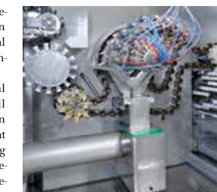
Exhaust performance was optimized through scientific support: Overspray is extracted and fed directly out of the machine room.

Everybody at Sprimag is now eagerly awaiting the reactions by customers during the official presentation on the exhibition stand at METPACK. Sprimag is extremely confident that METPACK 2014 will be the start of another success story.