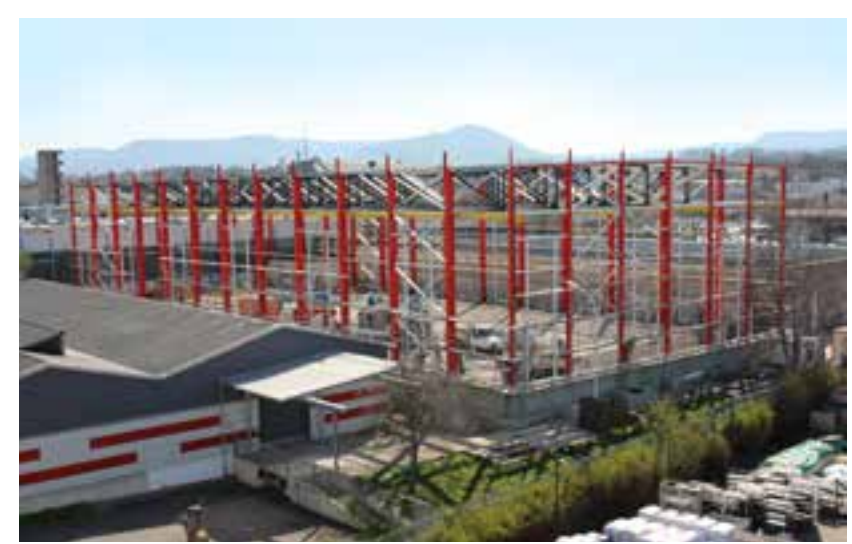
The assembly hall with over 2,000 m², will be used as a final assembly hall for Sprimag coating machines.