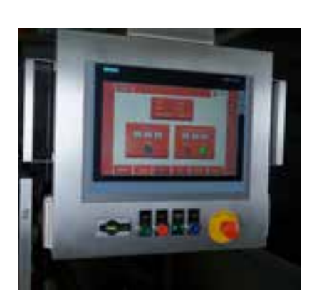
A moving front panel and direct electropneumatic control of the spray guns increase ease